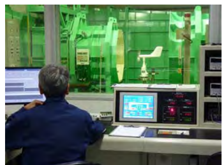
Verification of a Wind Vane/Anemometer