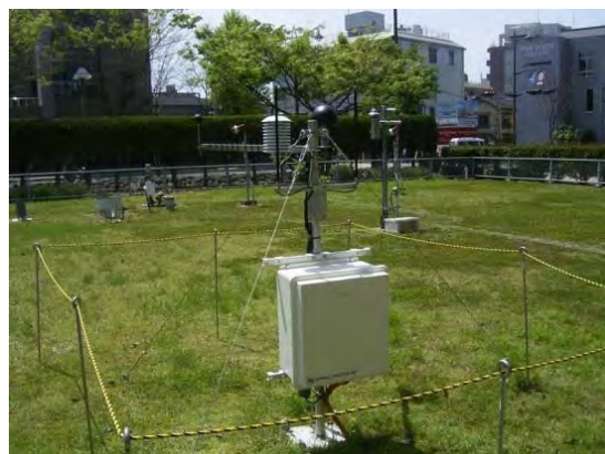
Research on Heat Illness Prevention