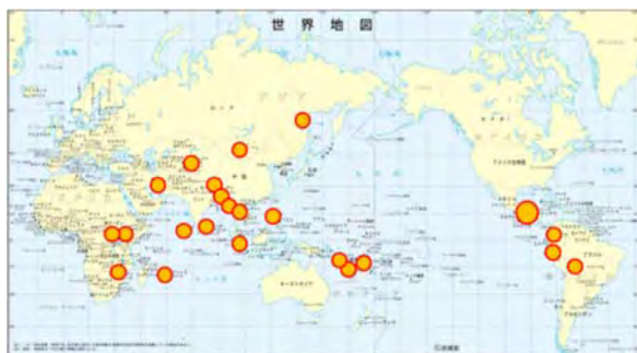
Development Cooperation Projects (funded by JICA and others)

International cooperation is conducted through the international development cooperation projects by the Japan International Cooperation Agency (JICA) and others in more than 20 countries.