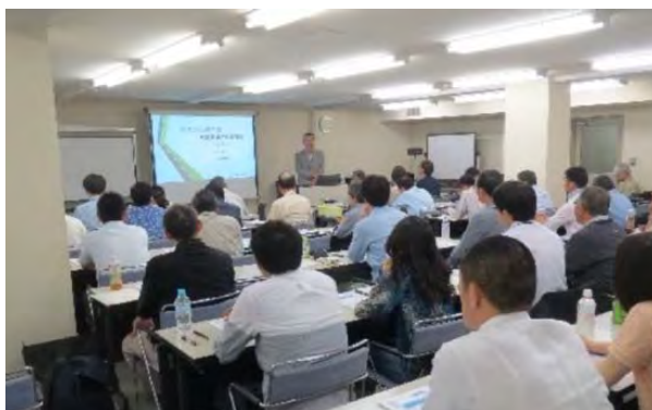
Seminar on Latest Forecast Techniques

JMBSC provides basic and practical training courses on weather/climate monitoring and forecast. Several spot seminars are organized to transfer forecast techniques newly developed by JMA to the private weather forecasting industry.