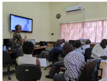
JICA Training on cyclone monitoring and forecast in Mozambique

In order to maintain the meteorological observation accurate, consistent and valid, the verification of meteorological instruments is indispensable. In Japan, it is regulated that official meteorological observations shall be performed with the officially verified instruments in compliance with the Meteorological Service Act of Japan. While JMA has the responsibility for the verification of meteorological instruments as the national authority, the individual verification tests and issuance of certificates of instruments for surface and upper-air observations are carried out by JMBSC, with the authorization by JMA, in accordance with the procedures and guidelines established by JMA.